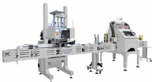
EZ-150SL Shrink Sleeve Applicator & ThermoFlow® Steam Shrink Tunnel

EZ-Standard shrink systems are ideal for production lines that produce multiple products and SKU's at speeds up to 150 cpm. They offer unmatched flexibility and they are widely used for full body shrink sleeves, tamper evident bands and twin packs. They are a popular choice in a variety of industries including prepared foods, personal care, cosmetics, dairy, pet products and nutritional supplements. Product changeovers are toolless and they can be completed in minutes. EZ-Standard shrink systems can include steam, radiant or convection heat tunnels and experienced Axon application engineers will assure your system is configured to deliver dependable performance.