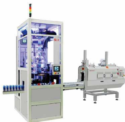
SLX Shrink Sleeve Applicator & ThermoFlow® Steam Shrink Tunnel

Axon SLX shrink systems are built for speed. They are ideal for high speed applications up to 800 cpm and they are optimized for cylindrical ready-to-drink beverage and food containers with diameters from 1.2" (30mm) to 4.9" (125mm). SLX sleeve applicators are mandrel style machines that use servo-motor systems to deliver fast, tool-less five-minute size changeovers and consistent, repeatable performance. SLX applicators feature our most advanced technologies including Digital Recipe Parameter Control. With this feature four critical machine set-up and operating parameters are stored for each container recipe. Digital Recipe Parameter Control assures that the machine will not start production, or continue production, if one or more of the recipe parameters is out of specification. This feature is ideal for high speed machine operation in demanding production environments and it improves both operating efficiencies and product quality. SLX shrink systems typically include steam heat tunnels but radiant or convection heat tunnels are also available for select applications. SLX shrink systems are used for full body shrink sleeves and tamper evident bands. They are a popular choice for ready-to-drink beverages and foods.