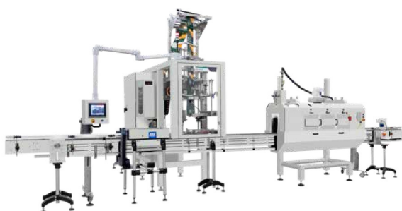
Aurora Wide Sleeve Applicator & ThermoPoint® Steam Shrink Tunnel