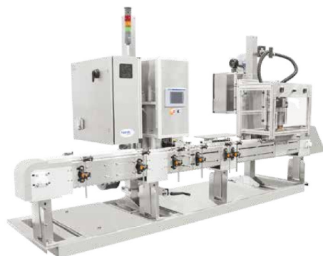
HZ-100 Shrink Sleeve Applicator & Integrated Forced Hot Air Shrink Tunnel

HZ-100 horizontal shrink sleeve systems are a proven solution for leading beauty and personal care product companies around the world. HZ-100 shrink sleeve systems are specifically designed for small diameter cylindrical products that are best handled in a horizontal orientation. It is an ideal solution for small tubes or other unstable products that would otherwise require expensive and inefficient puck container handling systems. Typical applications include lipstick, lip balm, eyeliners, mascara and other similar cosmetic products. Other applications include writing instruments such as magic markers. Two models are available, one for speeds up to 60 cpm and the other for speeds up to 120 cpm. The HZ-100 features an integrated sleeve applicator and forced hot air shrink tunnel built on a single, stainless steel monobloc frame. The system includes a horizontal applicator with static reduction system, an innovative after-tamp sleeve centering station, an integrated compact heat tunnel, a roller conveyor that rotates product inside the heat tunnel and a discharge ramp for gentle discharge of products from the system.