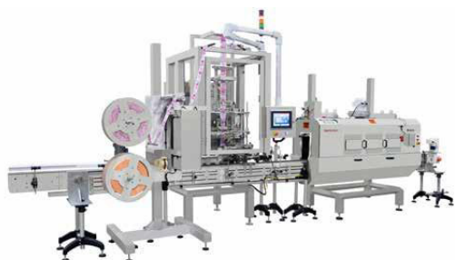
Aurora® Shrink Sleeve Applicator & ThermoPoint® Steam Shrink Tunnel

EZ-150SL shrink systems are a value priced solution ideally suited for cylindrical containers including aluminum cans and glass or plastic bottles. They were initially developed for the craft brewing industry and they are designed and configured for budget constrained production lines requiring speeds up to 150 cpm. EZ-150SL systems are simple to operate and they maintain their low price point by eliminating frills and by offering a limited number of options. They are widely used for ready-to-drink beverages, canned beers, wines, nutritional supplements and personal care products. EZ-150SL shrink systems can include steam, radiant or convection heat tunnels and experienced Axon application engineers will assure your system is configured to deliver dependable performance.