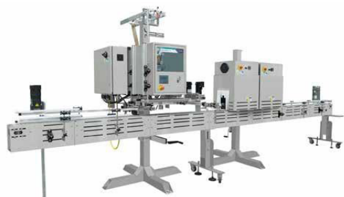
EZ-130 Shrink Sleeve Applicator & EZ-48-SRB Convective Heat Shrink Tunnel

Axon offers six families of shrink sleeve and tamper band systems. Each family is based on the recommended applicator and an appropriate shrink tunnel for the customer's applications. With over one-hundred available applicator and tunnel combinations, Axon can provide a complete system ideally configured for your applications and your budget.